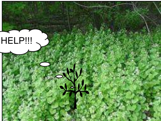
Infestations, such as this garlic mustard, limit the growth of tree seedlings.